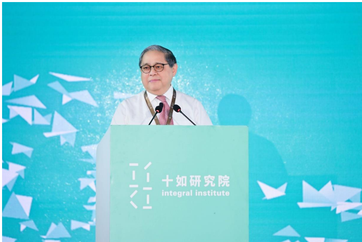
Dr. Victor Fung, Chairman of Fung Group, delivers a keynote speech.

Throughout the event, sessions included “CEO Plenary” and panels on “Rethinking Supply Chain”, “Harmonizing Nature and Culture”, “Social & Economic Innovation”, and “Integrating Well-being into Education”. In the “CEO Plenary”, industry leaders discussed integrating sustainability into business development. The conversation emphasized that sustainable innovation, corporate culture, and strong leadership are crucial for fostering both organizational success and community well-being.